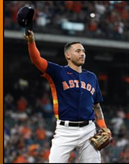
Carlos Correa Shortstop Houston Astros