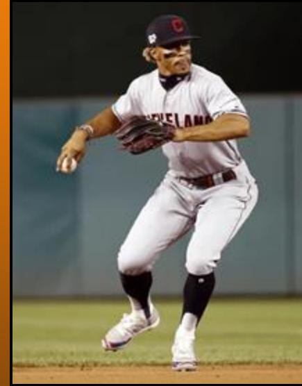
Francisco Lindor Shortstop Cleveland Indians