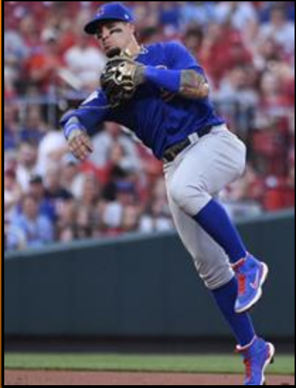
Javier Baez Shortstop Chicago Cubs